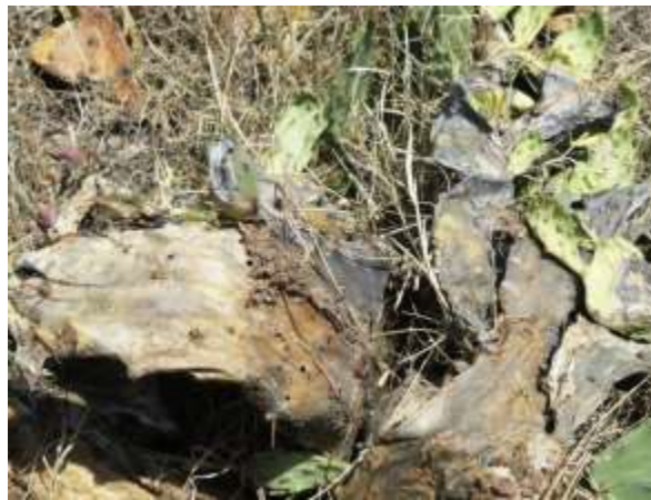
Fig. 10. Damaged wild cactus in District Chakwal.