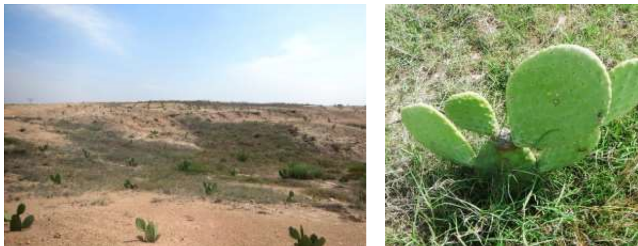
Fig. 4. Cultivation of spineless cactus O. ficus-indica under AIP in Chakwal for fodder purposes.

After the 2014 monsoon, Rangeland Research Institute, NARC under Agriculture Innovation Program (AIP) introduced spineless prickly pear species, i.e. Opuntia ficus-indica to cultivate in the fields of the targeted villages on approximately 30 ha ( Fig. 4 ).