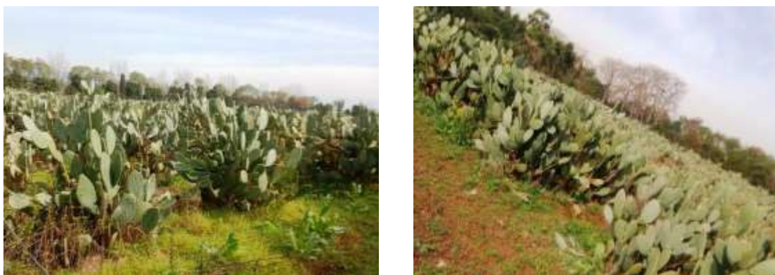
Fig. 2. Imported Cacti germplasm at National Agricultural Research Centre (NARC), Pakistan.

The district Chakwal is located at 32°56'17"N, 72°51'30.71"E., on the Pothohar Plateau, Punjab, Pakistan ( Fig. 3 ). It is situated in the north of the Punjab province, bounded by district Khushab to its South, district Rawalpindi to its northeast, district Attock to its northwest, district Jhelum to its East and district Mianwali to its West. District Chakwal is comprised of four tehsils namely Kallar Kahar, Chakwal, Choa Saidan Shah and Talagang. Dominant flora of the Chakwal districts consists of Acacia modesta , Acacia nilotica and Dalbergia sissoo . Approximately 50% of the area is uncultivated and primarily used for grazing animals, and about 11% is natural grasses and shrubs. District Chakwal is the largest peanut producer in Pothohar region, where the peanut is largely grown in the tehsil of Chakwal and Talagang, and peanut stubble is the main stock to the small ruminants in the area. Due to high demand of peanut straw in large cities, the shrubby vegetation mainly supports the grazing of goats and sheep.