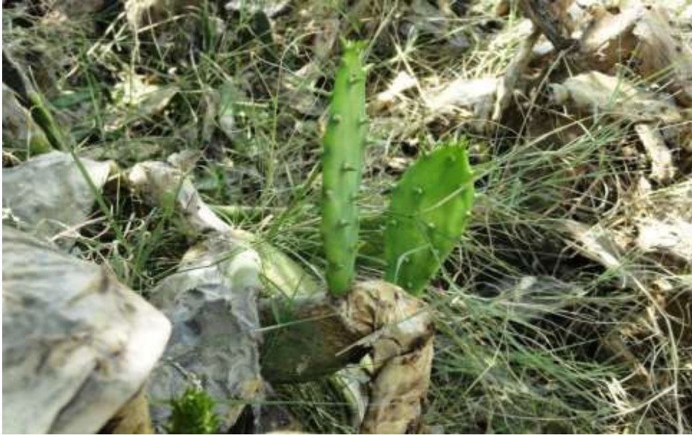
Fig. 11. Regrowth of cladode from debris/damaged cactus in District Chakwal.