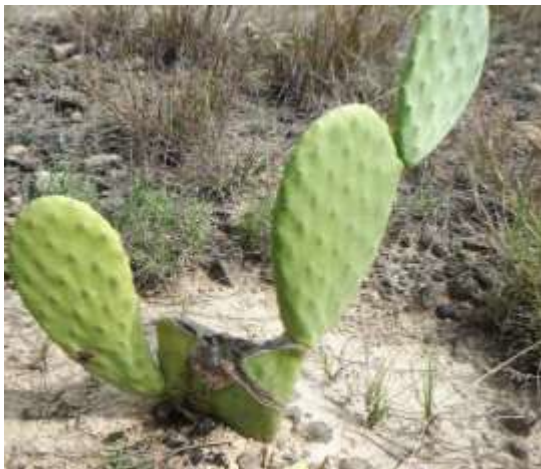
Fig. 5. Infested cladode of spineless O. ficus-indica in cultivated field in District Chakwal.

After planting, all fields were visited once a month. The growth of O. ficus-indica was found to be excellent in all the targeted fields until November 2016. However, during the December 2016 survey it was observed that a few cladodes of O. ficus-indica were found dead with infestation of an unknown pest ( Fig. 5 ). All infested pads were removed and burned. In December 2017, the same infestation was again reported and the majority of the cladodes were found to be infested. Infested cladodes were examined in the field and some lepidopterous larvae were found inside the cladodes ( Fig. 6 ). Larvae were brought to the laboratory of the National Insect Museum for identification. However, in July 2019 it was found that cultivated O. ficus-indica at all the three localities had completely vanished due to the heavy attack by cactus moth larvae (Figs. 7 & 8).