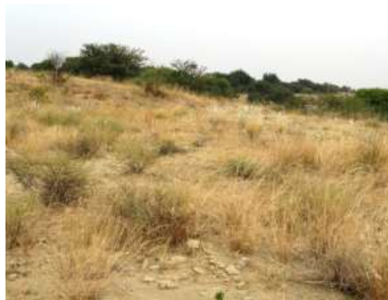
Fig. 8. Completely vanished field of O. ficus-indica in District Chakwal.