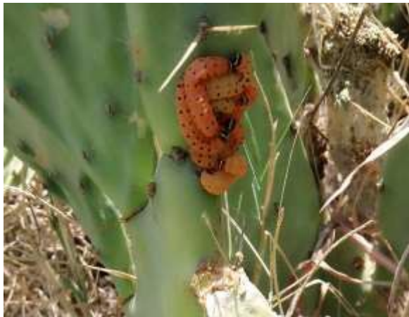
Fig. 9. C. cactorum infested cladode of wild cactus in District Chakwal.

After confirmation that the cladodes of cultivated O. ficus-indica were infested by the invasive moth, C. cactorum , plans were made to conduct detailed surveys for the whole district of Chakwal. Surveys were conducted for all tehsils of district Chakwal to discover the level of infestation of C. cactorum on wild Opuntia species which was introduced naturally/deliberated (Figs. 8 & 9). Surveys were consecutively conducted from July 2019 to July 2021. During consecutive surveys over two years, it was found that sporadic plantation of wild cactus throughout the district Chakwal was in the stage of re-growing (Fig. 11) from the debris of the cactus, which were damaged through the heavy attack of the larvae. However, larvae were found at various localities in tehsil Talagang of district Chakwal on wild cactus. In all surveyed localities wild cactus was severely infested by the cactus moth and threatened (Figs 7 & 10). During this study establishment of C. cactorum has been confirmed after the introduction of the cactus moth larvae in the district Chakwal, Pakistan during 1994.