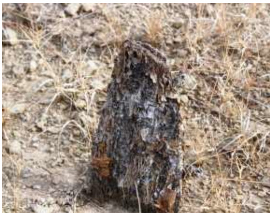
Fig. 7. Dead cladode of O. ficus-indica in vanished field in District Chakwal.