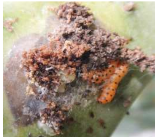
Fig. 6. Larvae inside the cladode of O. ficus-indica in District Chakwal.