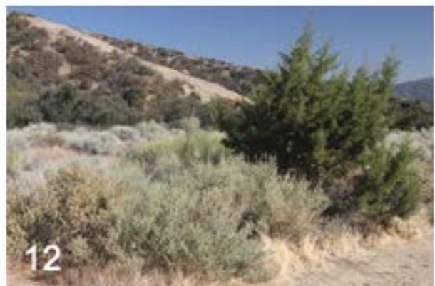
Fig. 7. P. emigdionis mature larva on At. canescens . Fig. 8. P. emigdionis larval feeding damage on At. canescens . Fig. 9. P. emigdionis pupa, lateral view. Fig. 10. P. emigdionis pupa, lateral view. Fig. 11. Tachinid fly ex P. emigdionis pupa. Fig. 12. P. emigdionis colony site near Gorman, Los Angeles Co.