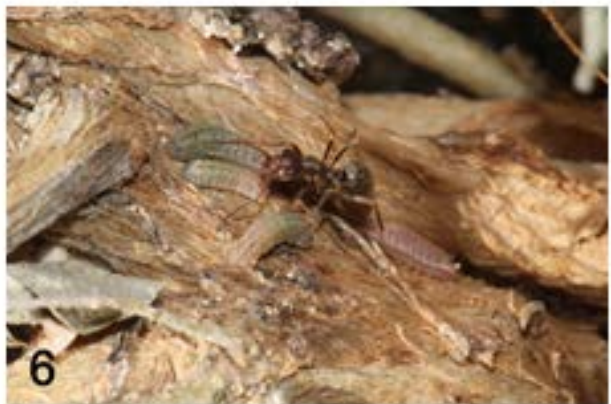
Fig. 1. Adult P. emigdionis . Fig. 2. P. emigdionis ovipositing. Fig. 3. P. emigdionis egg on A. canescens leaf. Fig. 4. P. emigdionis egg on A. canescens crown. Fig. 5. P. emigdionis larval cluster on underside of prostrate branch. Fig. 6. F. francoueri with 2 nd instar P. emigdionis larvae. All figures are on A. canescens .