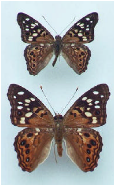
At Left Top: neotype ♂ Asterocampa celtis Brigham Landing, Burke Co., GA. Bottom: typical ♂ Asterocampa reinthali Berkeley Co., SC. (Picture reproduced from TTR 1:5 Fig. 3)