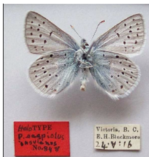
Figure 4. Ventral view of the putative insulanus “holotype” (now a lectotype) in the CNC.