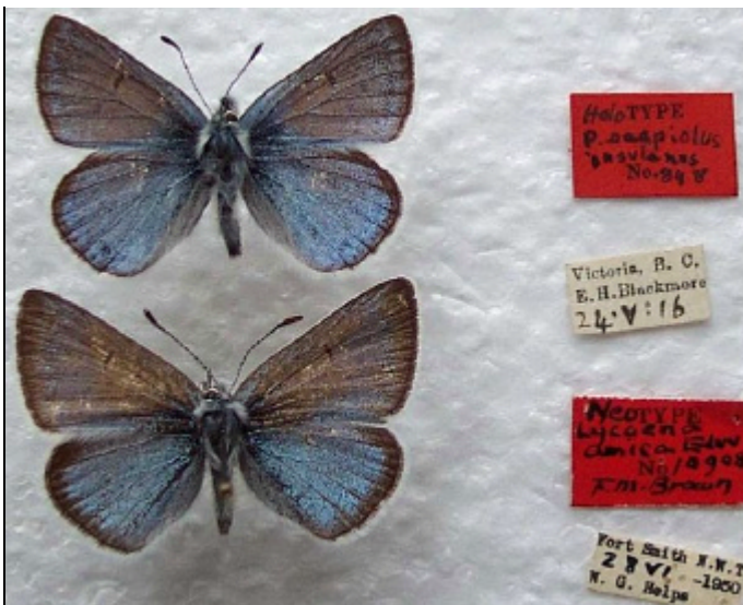
Figure 7. Dorsal view of insulanus (top) and amica (bottom) types.

It is clear from this brief review that there are numerous and conflicting interpretations regarding Aricia saepiolus in northwestern North America. It is equally clear that there is insufficient information presented in the literature to allow an unambiguous assessment of which interpretation is most defensible and congruent with reality in the field. There is no clarity as to where saepiolus grades into insulanus and amica or even if they do. There is no clarity as to where kodiak grades into amica . The literature also presents differing descriptions of the appearance of the taxa under discussion. We do not elaborate on that here since it is more appropriate to include in a future taxonomic review.