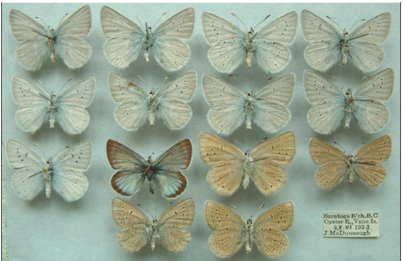
Figure 12. Additional insulanus specimens. Same specimens and same data as figure 11 above.