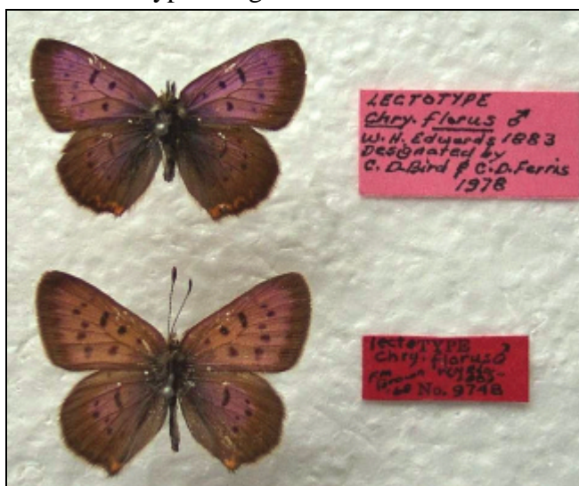
Figure 1. Dorsal view of the two florus “lectotypes” in the CNC.

Bird and Ferris (1979) designated the second lectotype. Their lectotype designation is the valid lectotype designation but not for the reasons they present in their paper. They express the view that the Brown lectotype designation is invalid because of an error in the type locality as provided by Brown. In