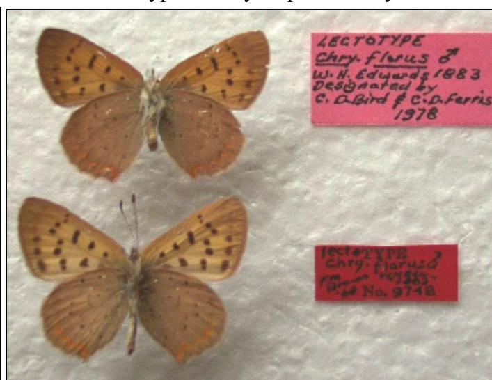
Figure 2. Ventral view of the two florus “lectotypes” in the CNC.