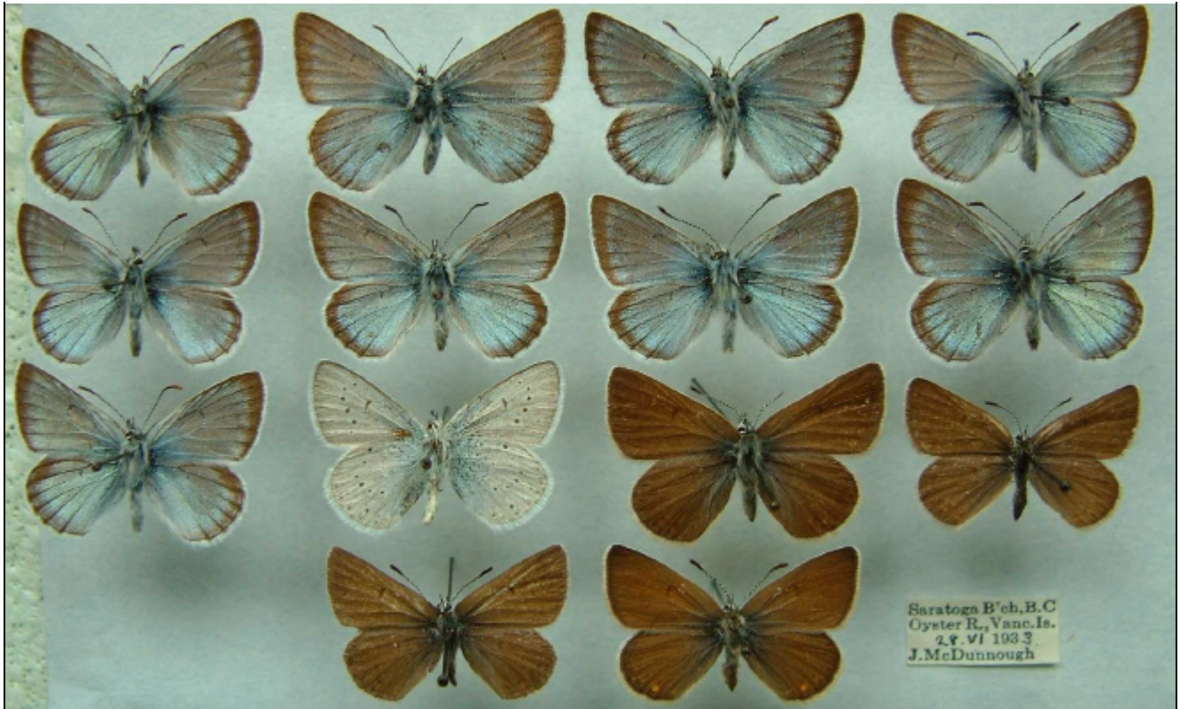
Figure 11. Additional insulanus specimens. More than one collection date on individual specimen labels, otherwise all labels are identical to the example shown.