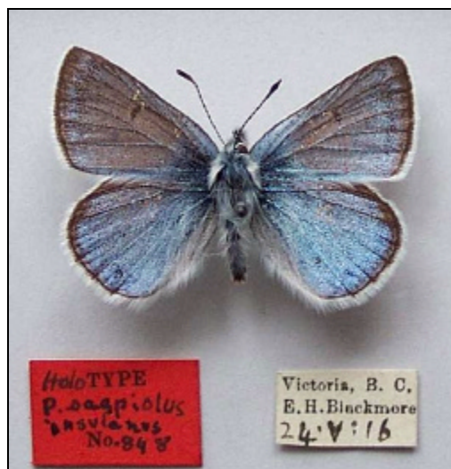
Figure 3. Dorsal view of the putative insulanus “holotype” (now a lectotype) in the CNC.