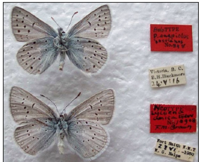
Figure 8. Ventral view of insulanus (top) and amica (bottom) types.