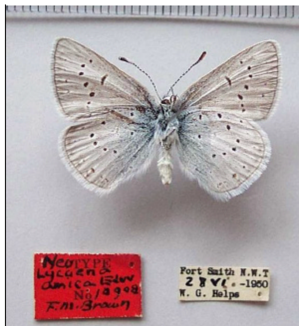
Figure 6. Ventral view of the neotype of amica in the CNC.