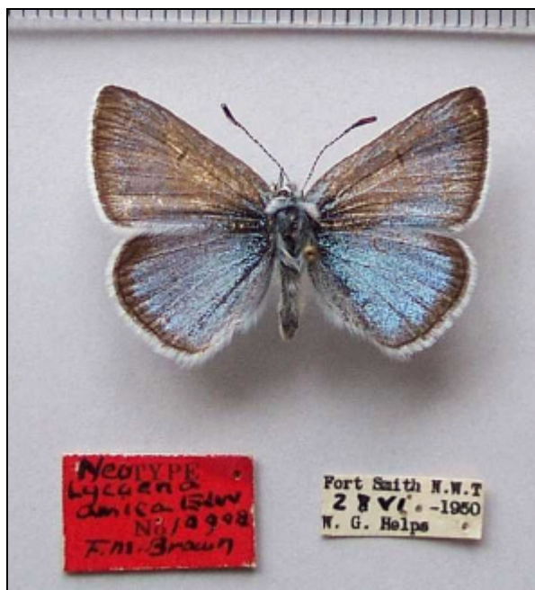
Figure 5. Dorsal view of the neotype of amica in the CNC.