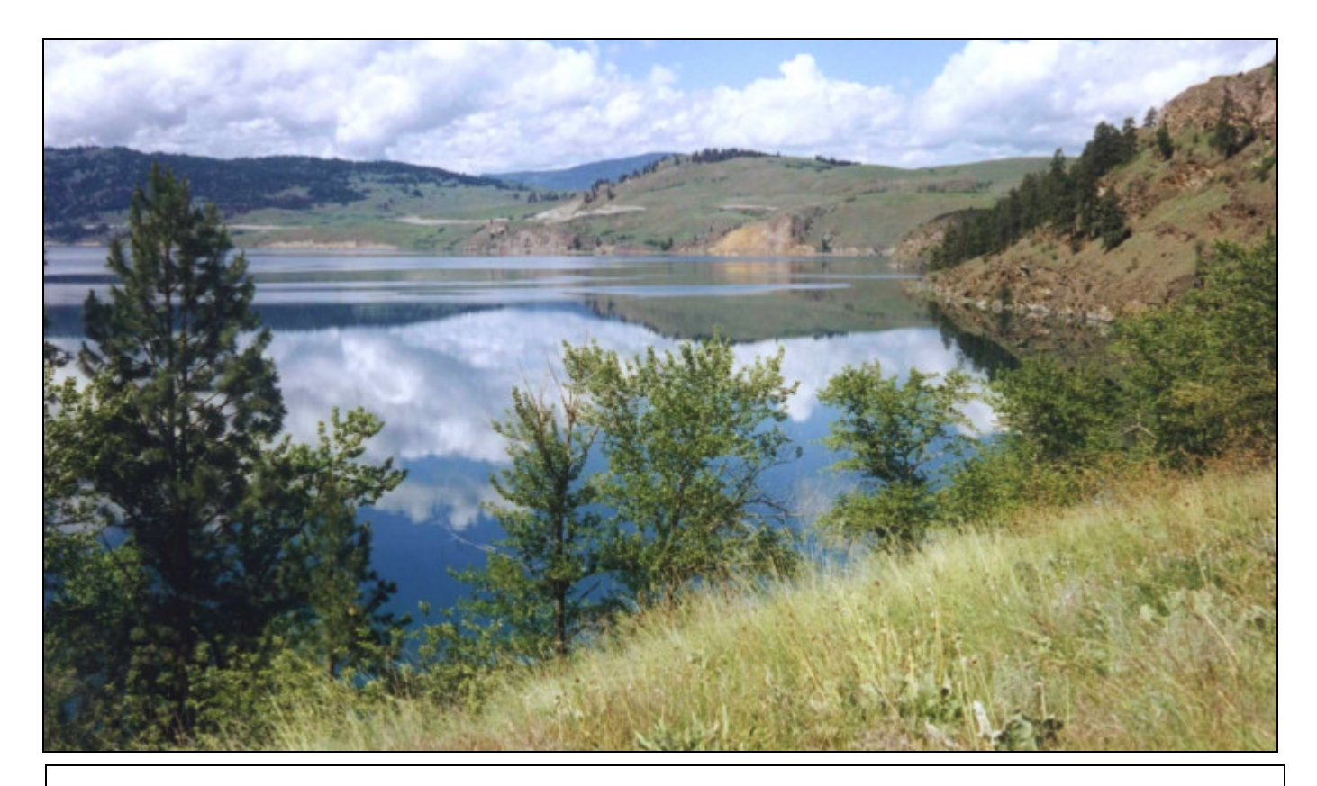
Figure 4. Kalamalka Lake Provincial Park.