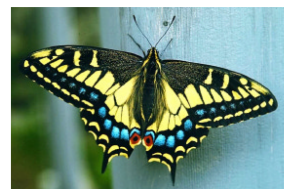
Fig. 15. Papilio zelicaon