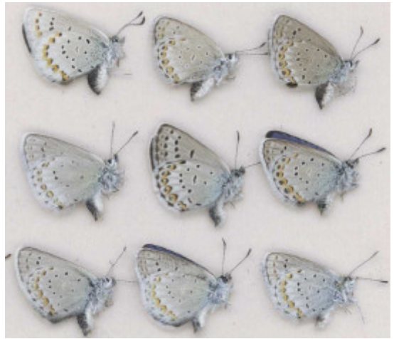
Fig. 17. Plebejus anna atrapraetextus and P. anna phenotypes from Shorts Creek canyon.