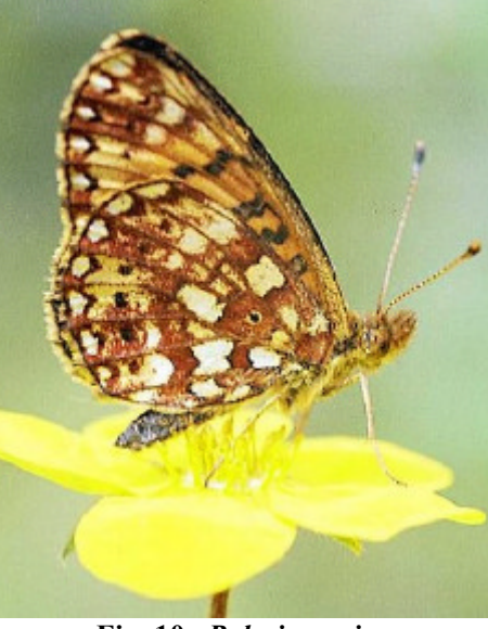
Fig. 10. Boloria myrina