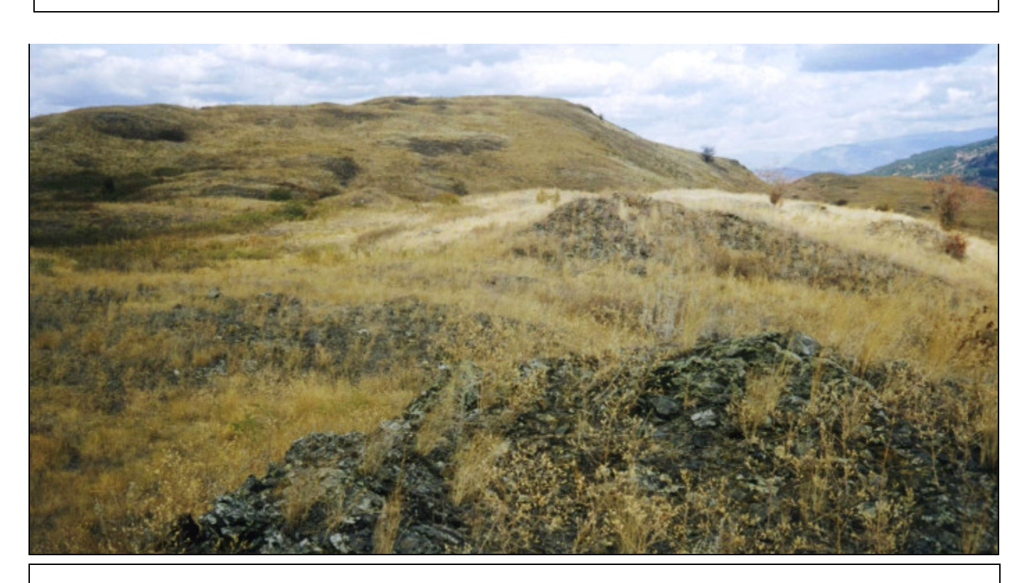
Figure 3. Goose Lake area just northwest of Vernon. Moderate elevation open grassland and rock outcrop habitat.

Figure 2. View from Vernon Hill looking southwest towards Kalamalka Lake.