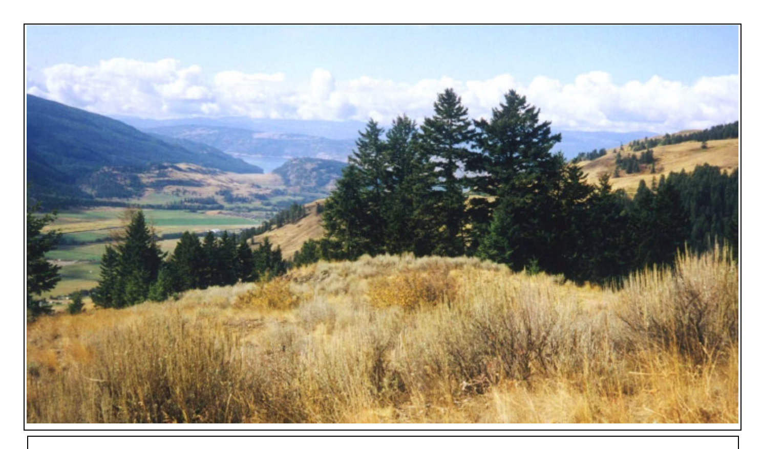
Figure 2. View from Vernon Hill looking southwest towards Kalamalka Lake.