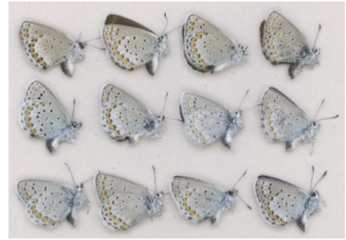
Fig. 16. Plebejus anna mostly atrapraetextus phenotypes. These and Fig. 17 specimens Leg. Threatful.