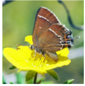
Fig. 13. M. spinetorum