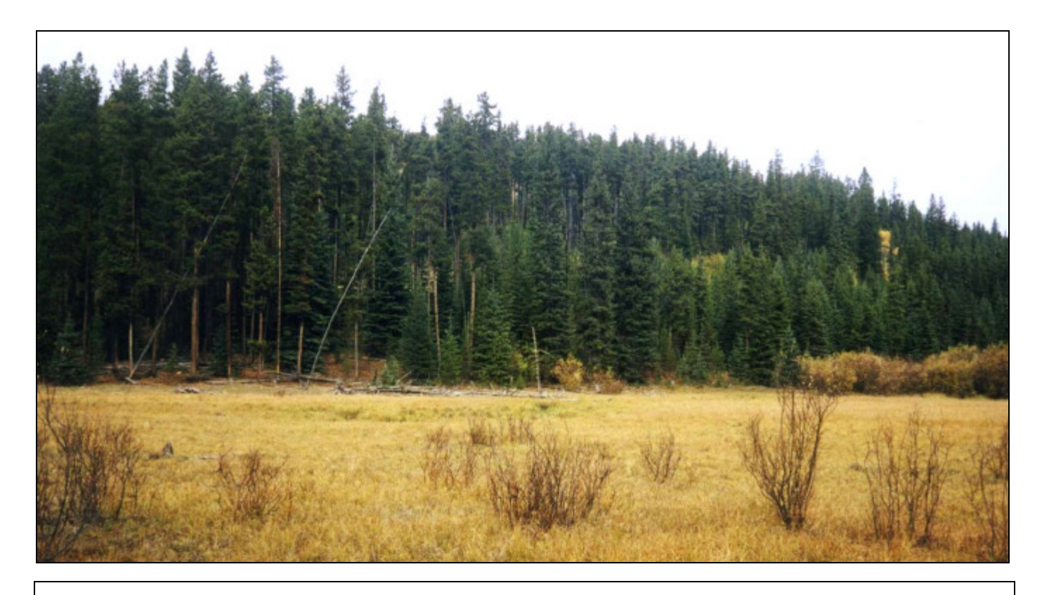
Figure 6. King Edward Lake area with a fen in the foreground and typical forest habitat in the background.