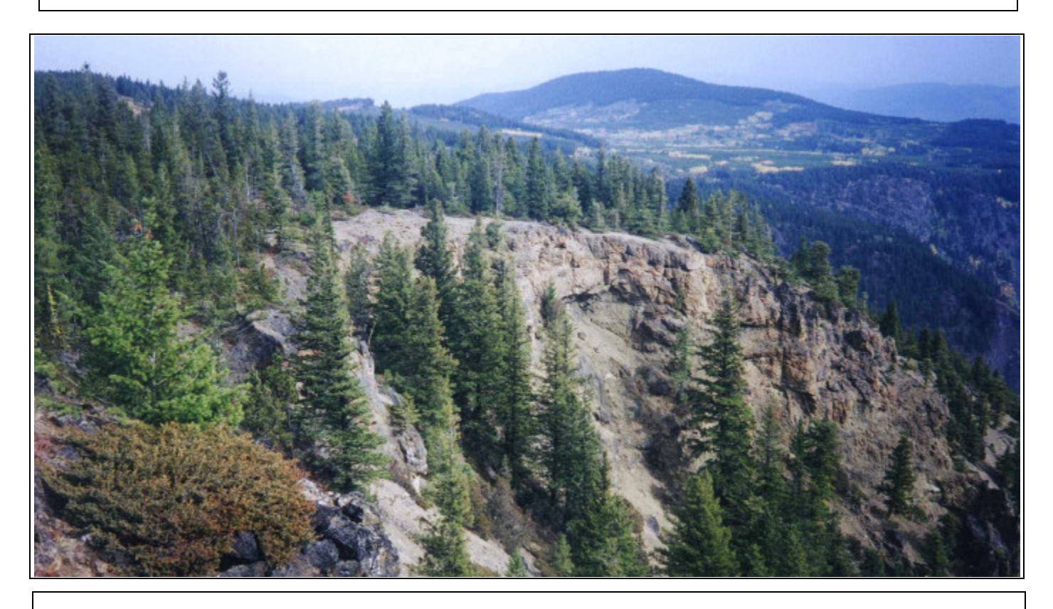
Figure 5. Shorts Creek canyon, north rim looking towards the northeast.

Figure 4. Kalamalka Lake Provincial Park.