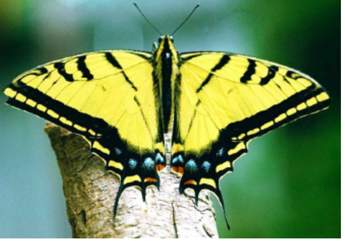
Fig. 14. Papilio multicaudatus