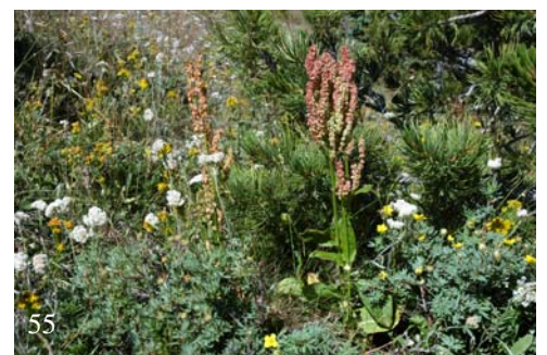
Figs. 50-55. Habitat of Lycaena phlaeas weberi at type locality. Fig. 50. Sweet Grass Hills, Montana, from the southwest, looking north toward Canada; from left, West Butte, Middle Butte (Gold Butte), East Butte, Grassy Butte, Haystack Butte. Fig. 51. Near the summit of Mount Royal, East Butte. Fig. 52. From the summit of Mount Royal looking north to the saddle and Mount Brown. Fig. 53. Looking back toward Mount Royal from the saddle. Fig. 54. L. p. weberi ♂ taking nectar from a preferred source, Solidago multiradiata (Goldenrod). Fig. 55. Rumex acetosa , presumed larval foodplant of L. p. weberi .