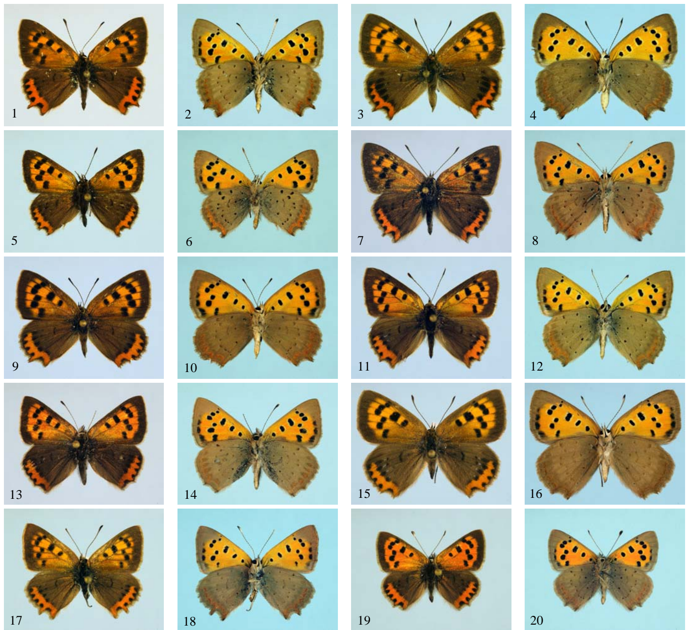
Figs. 1-20. Old World Lycaena phlaeas ssp. Fig. 1. L. p. phlaeas , Hagieni Forest nr. Mangalia, Romania, 6 June 1984, A. Popescu-Gorj Coll., ♂ dorsal. Fig. 2. Same, ventral. Fig. 3. Same, ♀ dorsal. Fig. 4. Same, ventral. Fig. 5. L. p. phlaeas , Skjeberg, Grimsoy, Norway, 29 July 1990, T.J. Olsen Coll., ♂ dorsal. Fig. 6. Same, ventral. Fig. 7. L. p. phlaeas , Naucelle Lespinassolle a chateau d'eau, 500m, Aveyron, France, 20 July 1990, J. Moonen Coll., ♂ dorsal. Fig. 8. Same, ventral. Fig. 9. L. p. phlaeas , Luberon, Vaucluse, France, 17 July 1983, ♀ dorsal. Fig. 10. Same, ventral. Fig. 11. L. p. phlaeas , Vergato, Italy, 3 May 1984, D. Cappelli Coll., ♂ dorsal. Fig. 12. Same, ventral. Fig. 13. L. p. phlaeas , Barcelona, Spain, 4 March 1980, ♂ dorsal. Fig. 14. Same, ventral. Fig. 15. L. p. phlaeas , Sierra Nevada, 1300m, Spain, 20 June 1988, J. Munoz Sariot Coll., ♀ dorsal. Fig. 16. Same, ventral. Fig. 17. L. p. eleus , Miseb, Malta, 26 May 1986, P. Samut Coll., ♂ dorsal. Fig. 18. Same, ventral. Fig. 19. L. p. lusitanicus , San Roque, Cadiz, Spain, 15 April, 1980, J.L. Torres Mendez Coll., ♂ dorsal. Fig. 20. Same, ventral. All figs. approximately 1.3X life size.